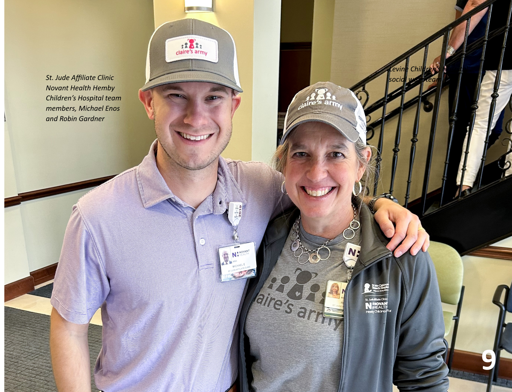
Levine Children's social workers